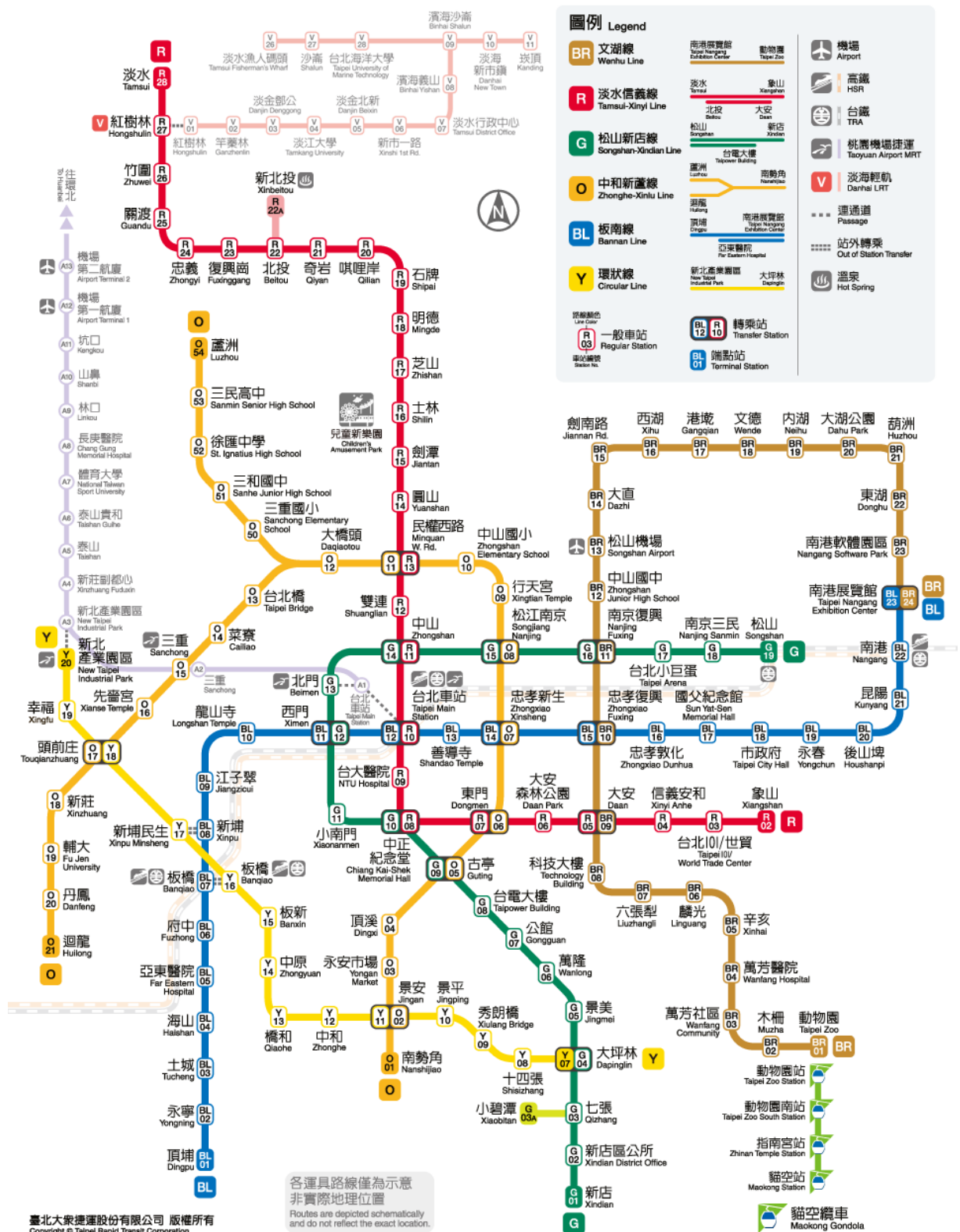
Image source: Taipei MRT official website http://english.trtc.com.tw/

https://english.metro.taipei/cp.aspx?n=1BE0AF76C79F9A38